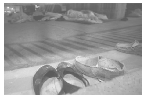
Migrant Worker Dies After Lying on Street for Over 20 Days