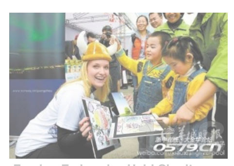
Foreign Embassies Hold Charity Sale, Receive Counterfeit Money