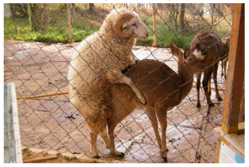
After squatting and watching for 4 days, a zookeeper captured this photo to respond to doubting netizens. This photo on weibo attracted many netizens' attention, and even shows that "love conquers all".